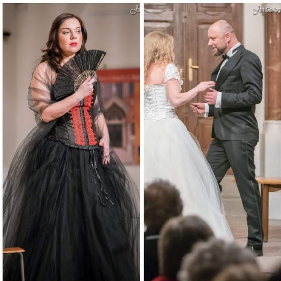
Don Giovanni - Japan