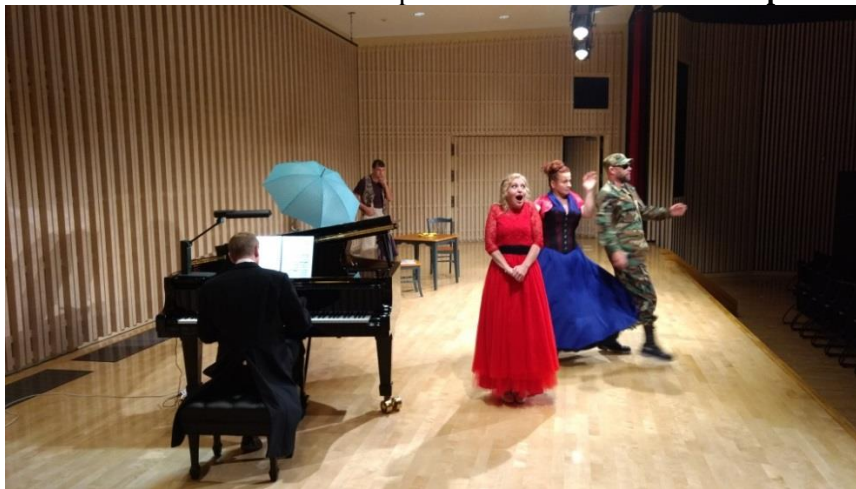
Elisir d'amore - Fukushima

She was lecturing The creation of a dramatic character at the Music Academy in Bratislava, and there began her more detailed relationship with work with young people, which she continues to do. She is an active teacher and does many workshops. She herself created several productions of cross-sections of opera and operetta (Carmen, Don Giovanni, La Traviata, Elisir d'amore, Csardasfürstin...) commissioned by a Japanese manager, which were successful on a tour of Japan, where she also tried to introduce young beginning opera singers. In this idea - to give opportunities and promote young artists, he continues and invites them to various performances. From Workshops and directing: