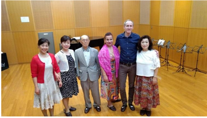
Workshop Opera Operetta Fukushima