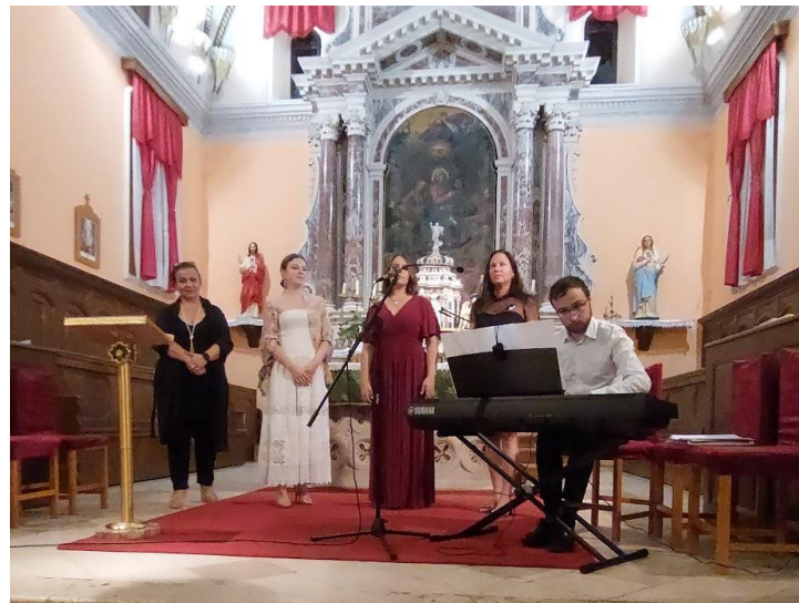
Concert Church of Holly Spirit, Vrbanj - Hvar 2022