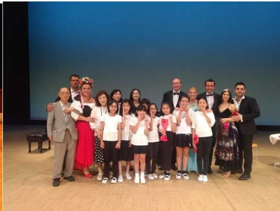
After performance with the workshop participants