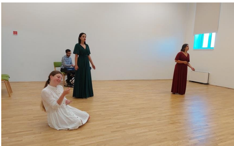
Workshop Final Concert Vrbanj 2022 - Hvar