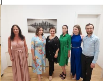
Slovak Songs Concert 2022