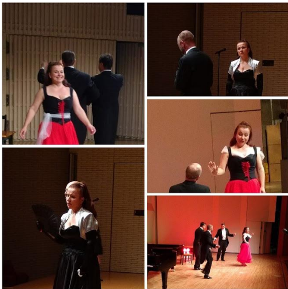
Die Csárdásfürstin - Japan