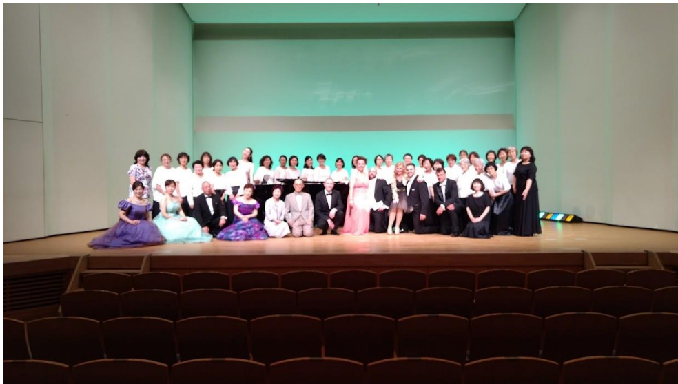
Workshop Opera Operetta Fukushima- Final Concert