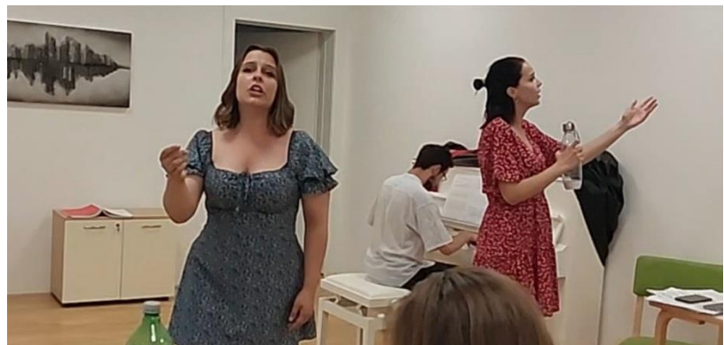
Reahersel - Hvar 2022