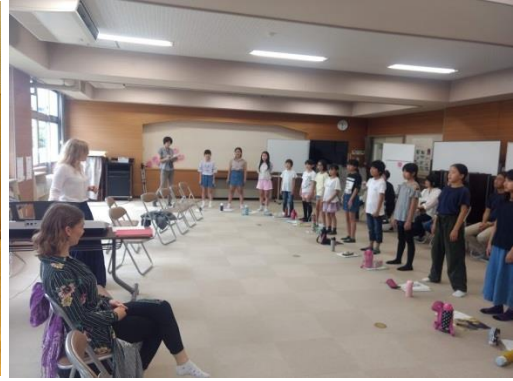
Japan - Childrens Workshop at school