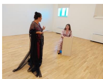
Workshop Hvar 2022