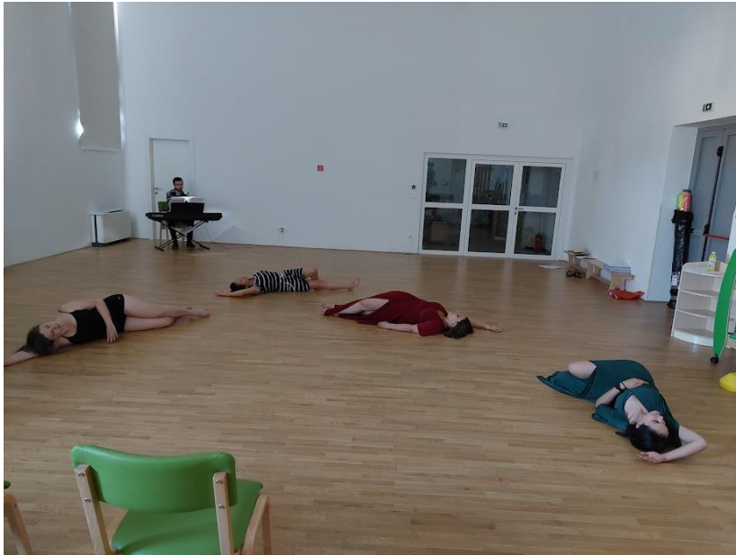
Rusalka - Hvar 2022